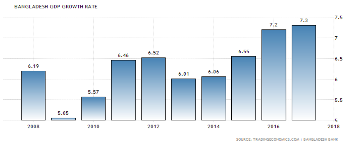
Figure- 5 (Bar-chart 3): GDP Trend 2008 to 2018