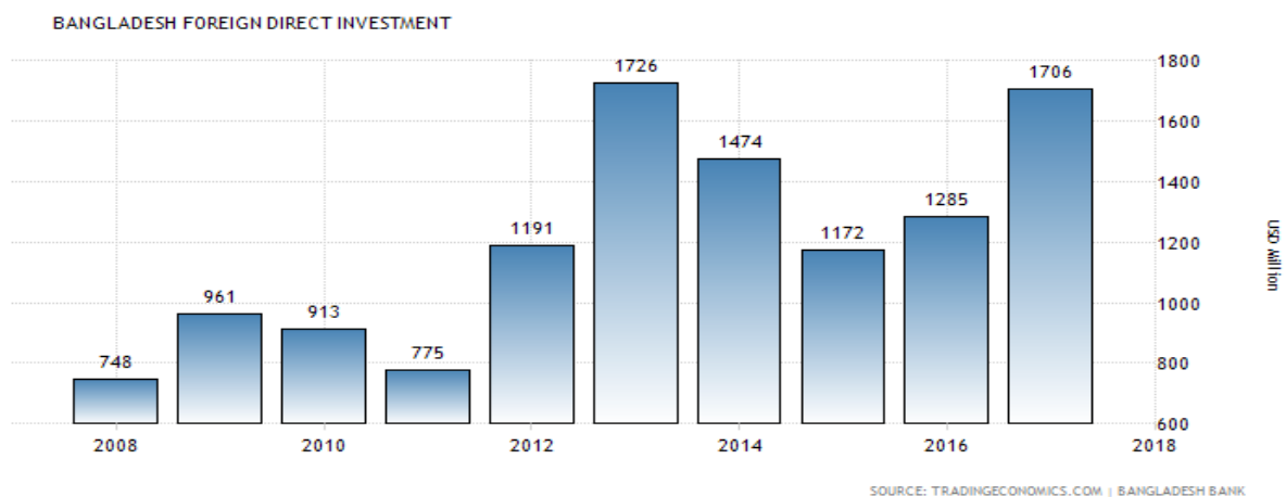
Figure-1 (Bar-chart 1): Trend of Foreign Direct Investment in Bangladesh