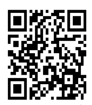
Accepted 16 August 2022 Published 20 August 2022 DOI: 10.5281/zenodo.7011824

Executive Hospitality International RTO is a vocational education college engaged in hospitality HR training services. Various marketing strategies carried out by Executive Hospitality International RTO to attract the interest of the target market continue their studies, such as using social media marketing and celebrity endorsers. therefore, this study aims to analyze the role of social media marketing and celebrity endorsers on the interest in continuing their studies at Executive Hospitality International RTO both directly and mediated by brand image. This study uses a quantitative survey research design on prospective students who have been recorded to continue their studies at Executive Hospitality International RTO in 2022 which is the population and sample of this study. Furthermore, the collected data were analyzed with SEM-PLS analysis techniques. The findings of this study demonstrate that each social media marketing variable and celebrity endorsement has a substantial impact on the brand. Brand reputation has a big impact on students' desire to keep learning. Additionally, social media marketing has the potential to significantly affect interest in further investigations through brand image, whether directly or indirectly. Celebrity endorsers' ability to sway consumers' enthusiasm in continuing their education at Executive Hospitality International RTO might be mitigated by a company's brand image.